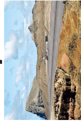
Passenger Terminal and Runway